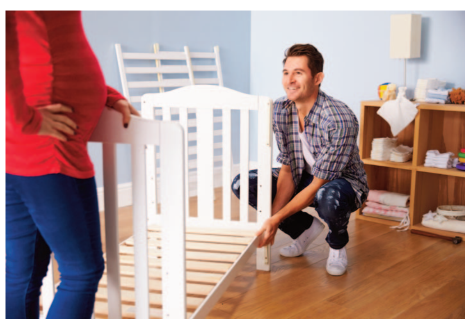
Under to pension law, birth or legal adoption of a child is one justification for a qualified leave of absence. Other acceptable reasons are personal illness, temporary assignment with another governmental employer, study or military service. Regardless of the reason, you must submit a Qualified Leave of Absence Request <u>OR</u> Notification of Military Service Entry (Form 46) before taking unpaid leave.

If you take an unpaid leave of absence for reasons other than those listed, your active membership ceases during the leave and your accrued service credit will be affected.